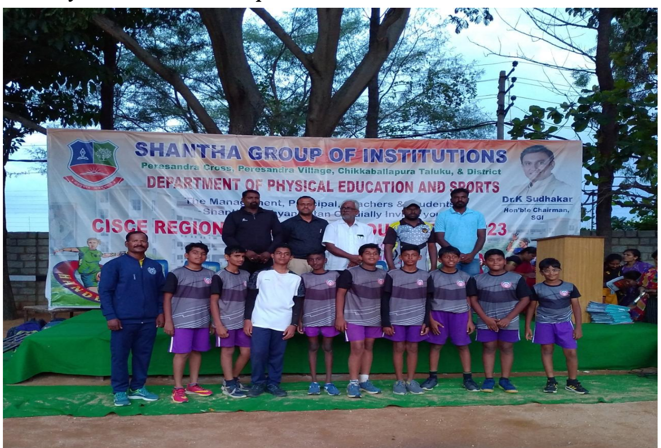
Under-14 Handball Boys Team

<sup>♣</sup> In the State level Handball Tournament, organised by Shantha Vidyaniketan Chikkaballapur, held on 7<sup>th</sup> July 2023, Our School U - 14 boys team won the First place.