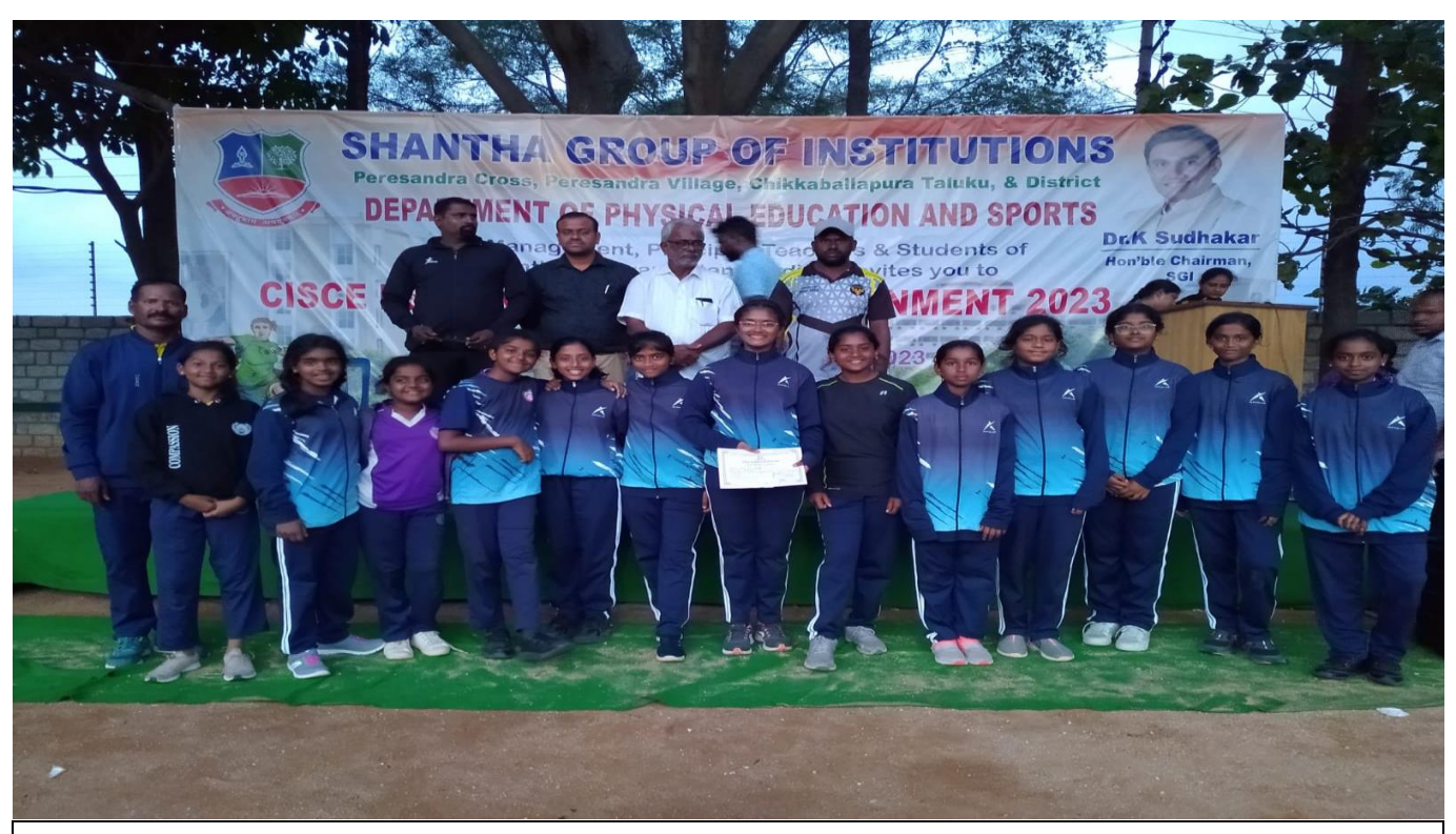
Under-14 Handball Girls Team